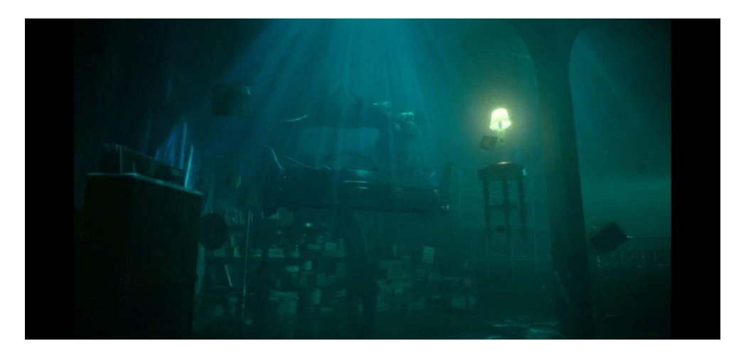
Fig. 2. Drowned building or apartment. (The Shape of Water 00:02:11)

it all... ( The Shape of Water 00:01:48- 00:02:50)