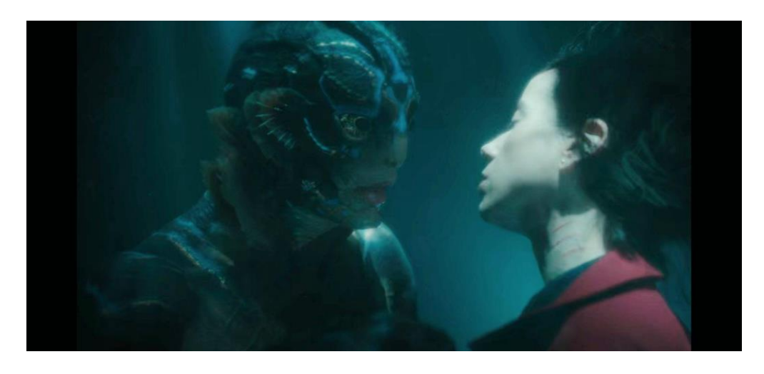
Fig. 1. The Amphibian human and Elisa. ( The Shape of Water 1:56:40)

officials also plan on killing the creature. Elisa overhears this and resolves to enlist Giles' assistance in order to save the amphibian human. Together with Dr. Hoffstetler, Zelda also offers assistance to her. Following this a series of scenes takes place which gives the audience more details about the amphibian human, his powers and the relationship between him and Elisa. The film closes with a lot of action and dramatic scenes as the amphibian human jumps into the river holding Elisa.