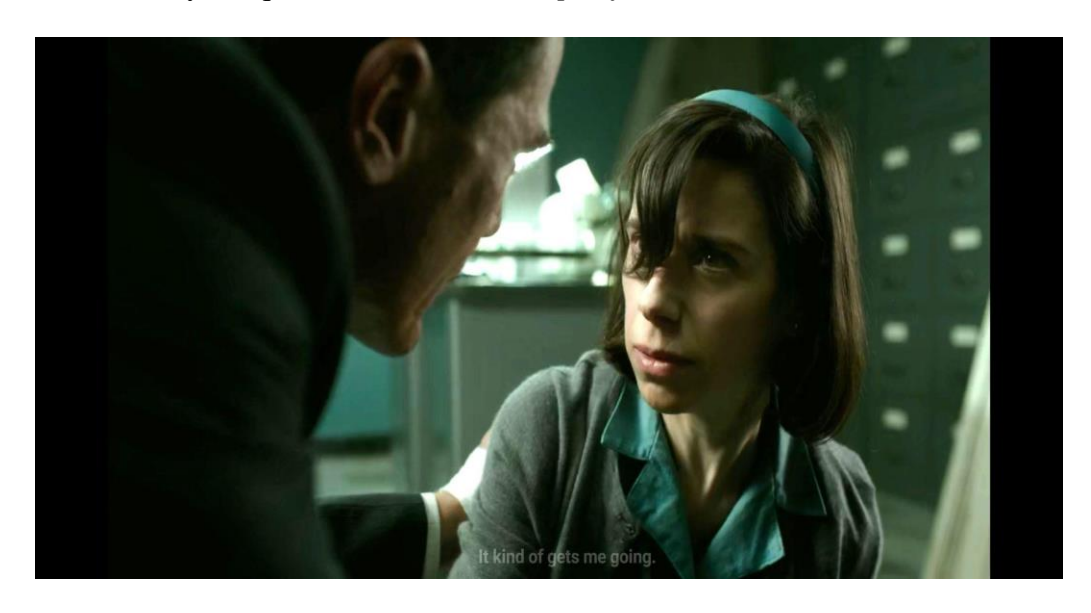
Fig. 4. Strickland intimidating Elisa ( The Shape of Water 00:58:26)

I bet I can make you squawk a little. ( The Shape of Water 00:57:56-00:58:50)