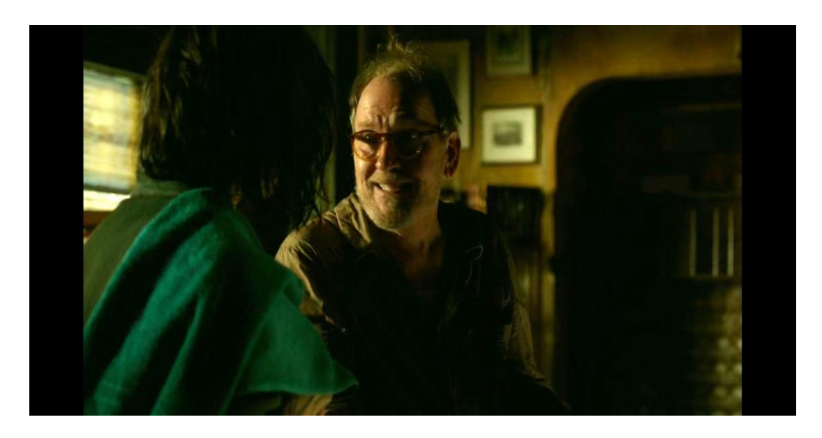
Fig. 6. Giles and Elisa ( The Shape of Water 1:32:27)

Hoffstetler is a scientist at the facility. He is the one who is undertaking the study of the creature. Hoffstetler is a Russian spy too. He is one person among the facility officials who is a little considerate about the creature. According to him the amphibian creature is a beautiful thing that has many unknown capabilities. When everyone at the facility views the creature as an asset, he is the only person who treated it as a living creature and showed care and concern. When the officials decided to kill the creature, he tried to save it. He says "I don't want an intricate, beautiful thing destroyed" (1:00:30-1:00:33). He helped Elisa to rescue the creature from the facility. Being a Russian spy, his life was always in danger. He lived under the constant threat of being caught and killed. The Russian officials actually used them to gain inside information. According to them he was a mere informer; who was only one among the many they had. They didn't mind killing them. So the officials plan to kill him. Strickland also sets out after him once he realizes that he is a Russian spy. From the film we understand that Hoffstetler received a very tragic end as he gets shot and is also tortured by Strickland.