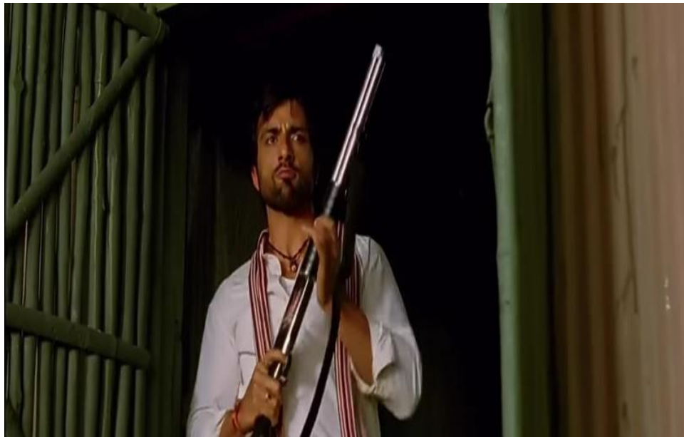
Figure 2.8 Chhedi takes out a gun in order to kill Chulbul Pandey