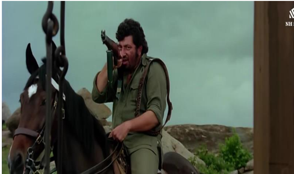
Figure 1.1 Gabbar tries to kill Inspector Thakur's family when He was not at home