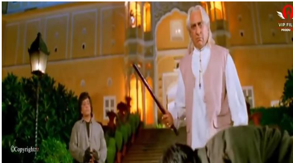
Figure 1.16 Raja beating up Shankar badly even though he was innocent