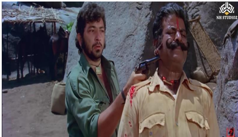
Figure 1.2 Gabbar gets angry with a hunchman who didn't fulfill the wish of killing

The duo. This made him point the gun to the hunchman