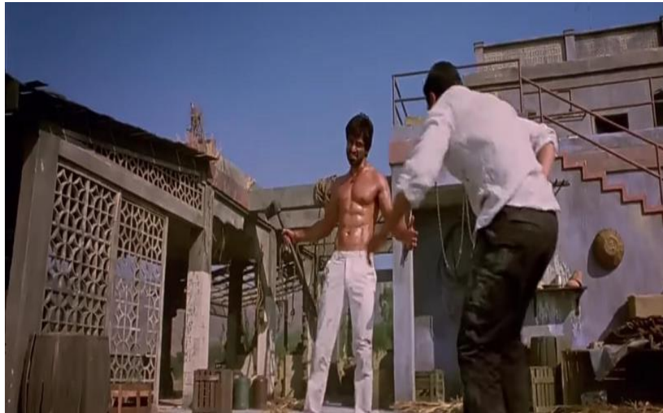
Figure 2.5 Chhedi rips off his clothes to fight with Chulbul Pandey