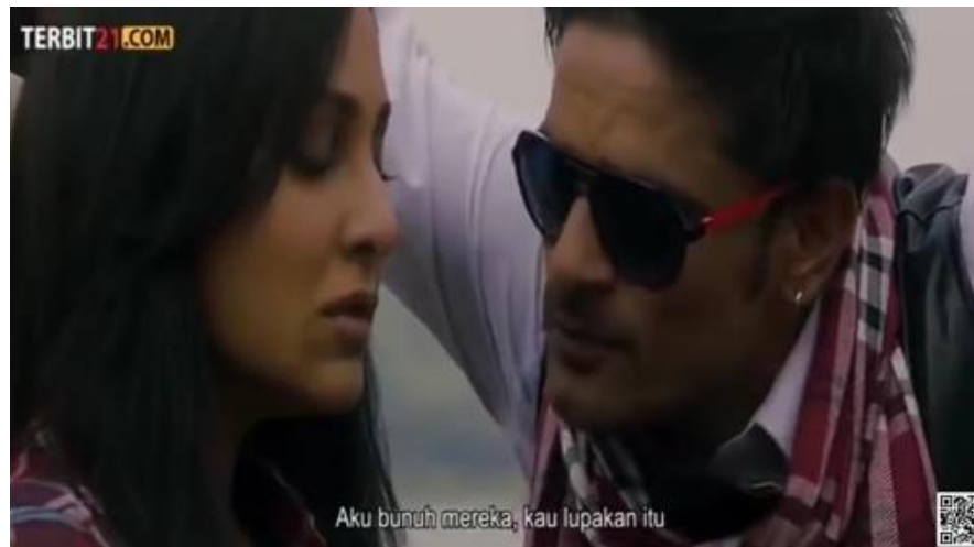
Figure 2.3 AK-47 having a conversation with the girl he wants to get married