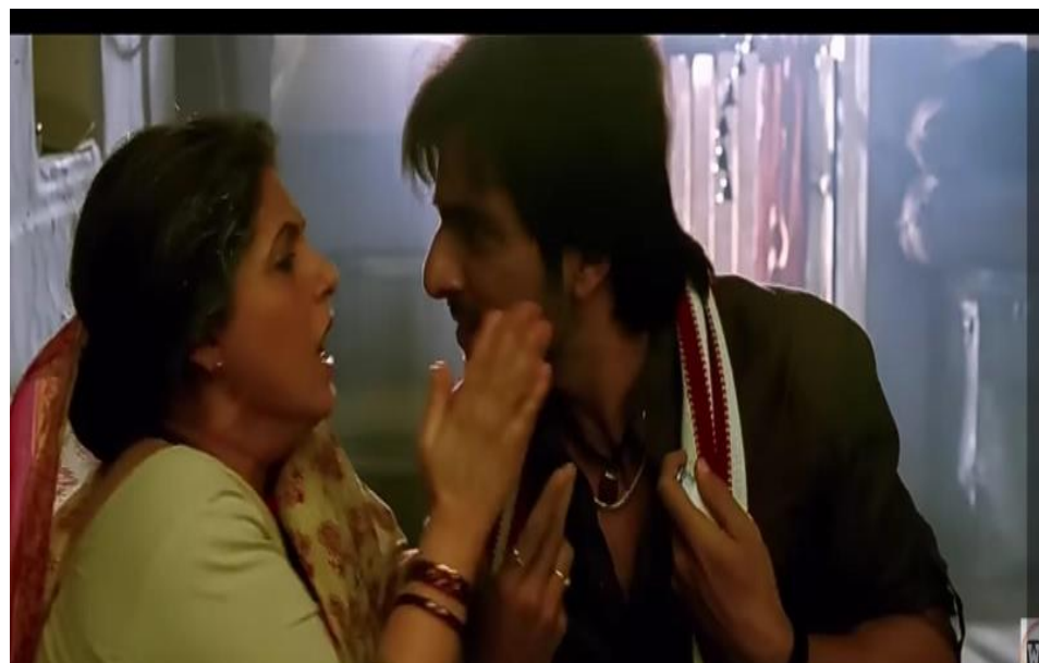
Figure 2.6 Chulbul Pandey's mother begging for her breathing device to Chhedi who Was trying to kill her