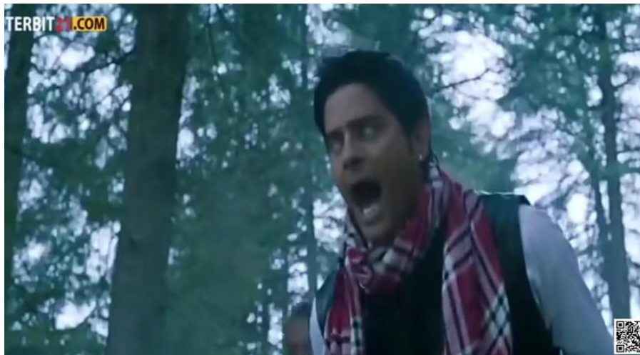
Figure 2.4 AK-47 getting frustrated because he failed to capture the duo

https://youtu.be/M1de4ytrtI . Accessed 17 Apr. 2023.