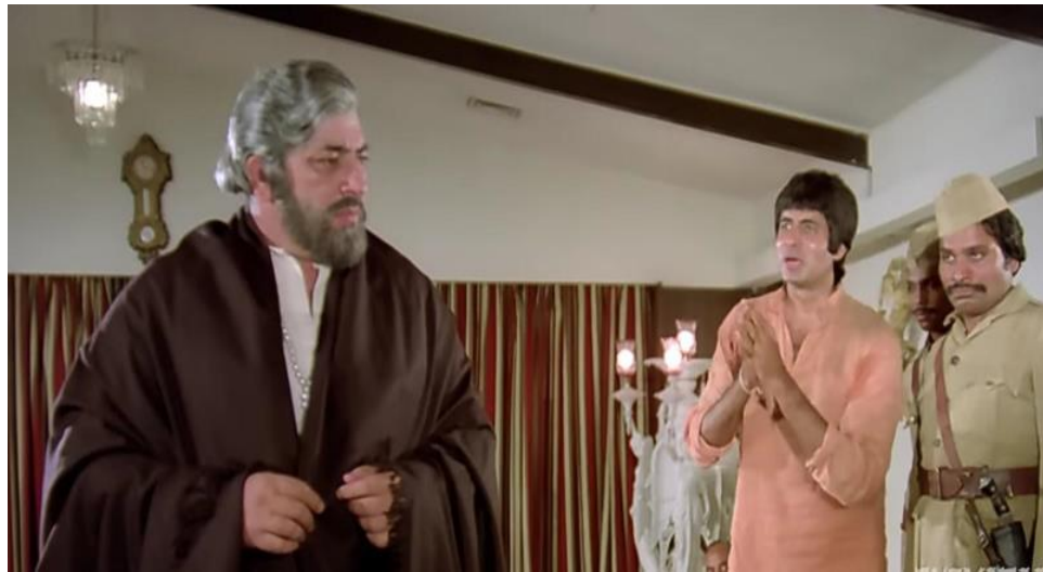
Figure 1.7 Kaalia/Kallu begging Shahani Seth for some money to treat his brother