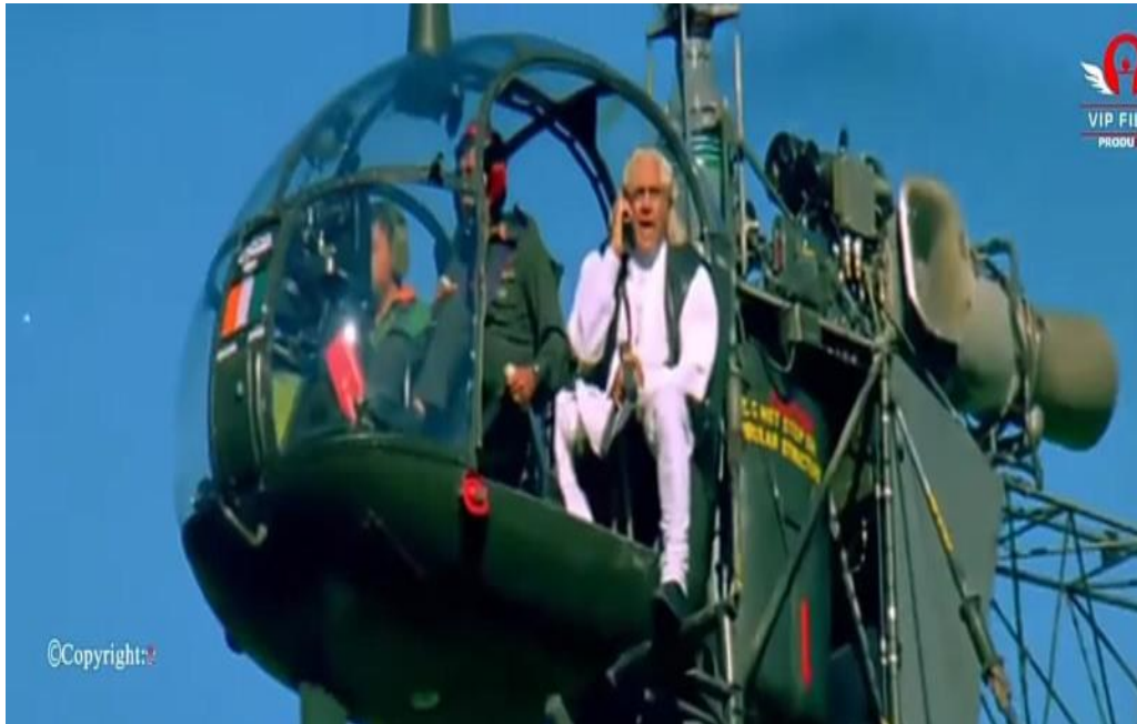
Figure 1.17 Raja finds both Shankar and Gauri who had fled from his palace to the forests

Baazigar is a hindi action thriller released in the year 1953, it was directed by Abbas Mustan. Some of the main characters in this movie are Shahukh Khan, Kajol, Shilpa Shetty and Dalip Tahil , Siddharth Ray and Jonny Lever. The plot of this movie revolves around a young man named Ajay Sharma , who was living with his sick mother due to an event which changed their lives. His main motive was to seek revenge on his father's assistant Madanlal who was the main man behind their plight. He started his mission by dating two of his daughter's named Seema and Priya. One day he met Madanlal accompanied by Priya during a car race in Madras, where he facilitated the chance of Madanlal winning since it was his last race before retirement. He also created an impression in Priya's mind by telling that he lose the race for winning her love. But even though he had dated Seema he changed his identity into Vicky. Later, To test their love Ajay forced Seema to write two identical suicide notes when he heard that Seema's father was going to marry her to another man. But later he revealed to her that it was just a prank and tore her note, after which they decided to get married in a registration office. But when they reached the office Seema was taken to the terrace by Ajay were she was pushed