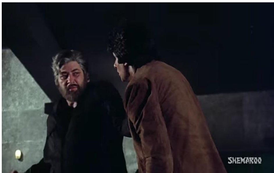
Figure 1.12 Shahani Seth fights with Kaalia/Kallu