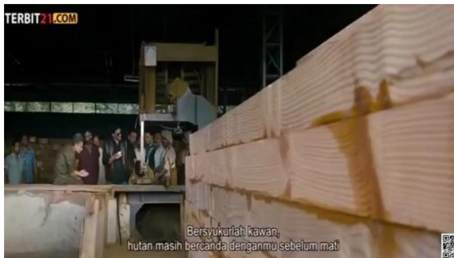
Figure 2.4 AK-47 beheading a forest officer )