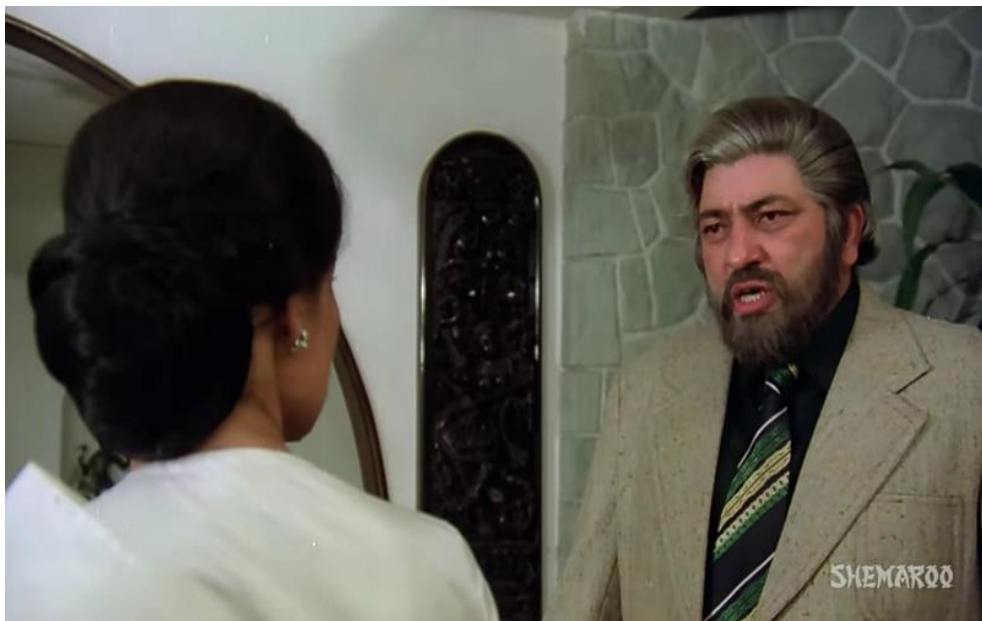
Figure 1.10 Shahani Seth blackmailing Kaalia's/Kallu's sister in law, by telling that he will Leave free her daughter from his clutches only if she agreed in court that Kaalia/ Kallu