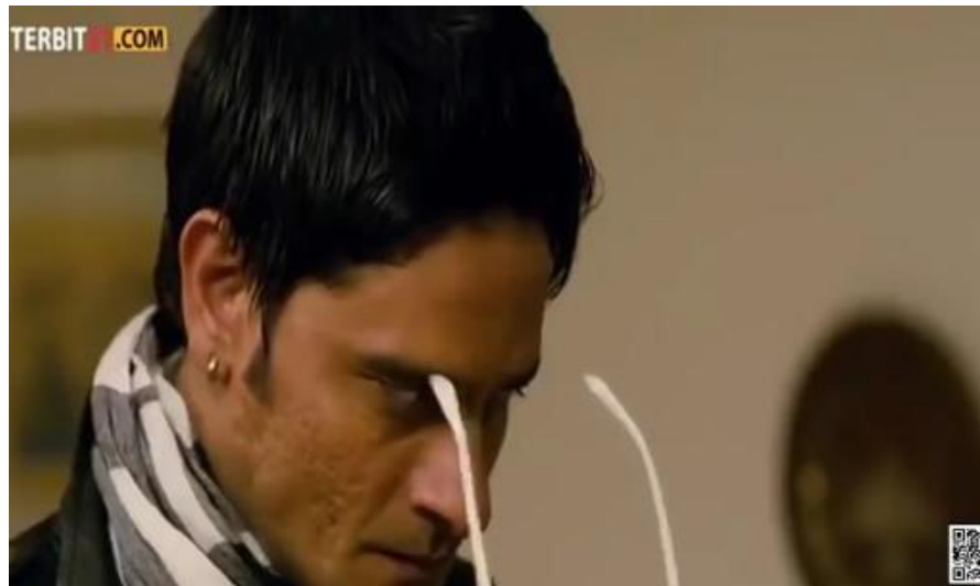
Figure 2.1 AK-47 stares the girl he likes in a creepy way