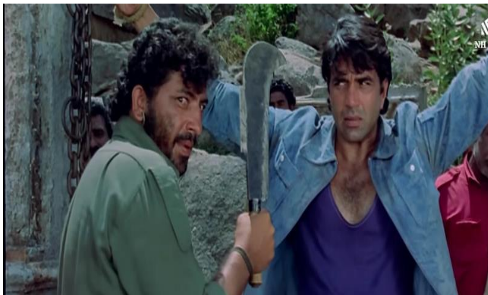
Figure 1.4 Gabbar pretending to slaughter Veeru