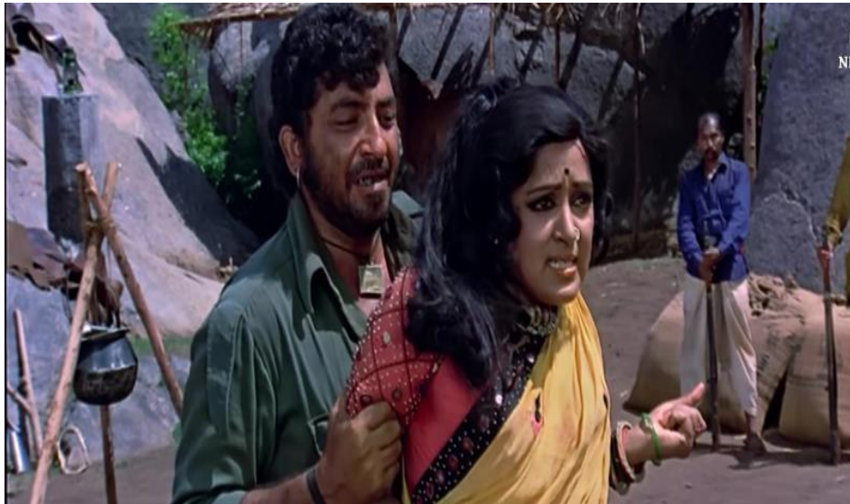
Figure 1.3 Gabbar physically assaulting Basanti, when he captured her along with Veeru who was helpless at that time.