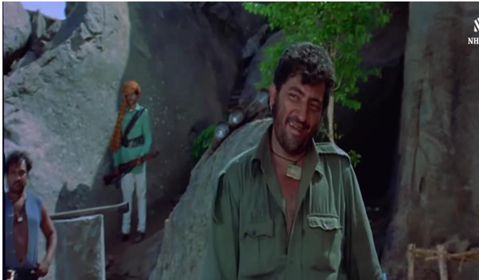
Figure 1.6 Gabbar having a conversation in an uncivilized manner