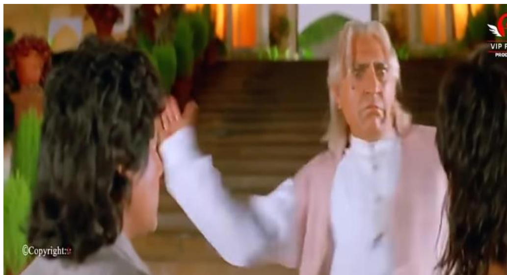
Figure 1.15 Raja going to slap Shankar